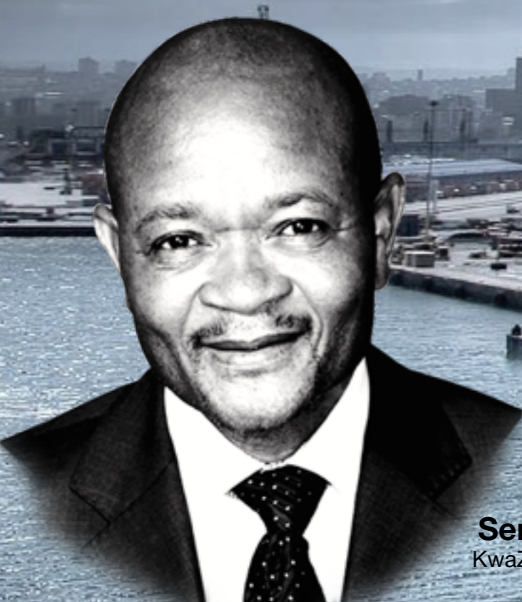
Senzo Mchunu KwaZulu-Natal Premier

African Economic Expansion Summit Invest in Africa's infrastructure growth story